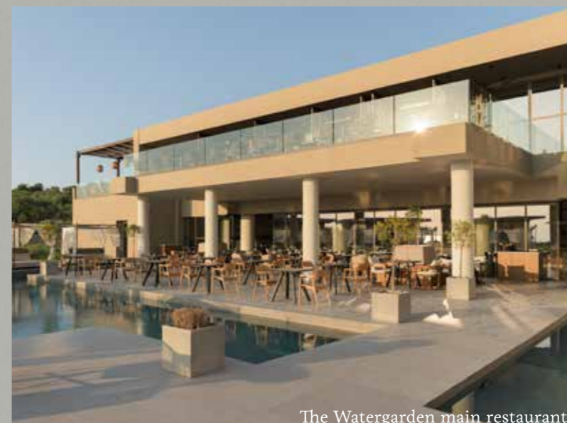
The Watergarden main restaurant