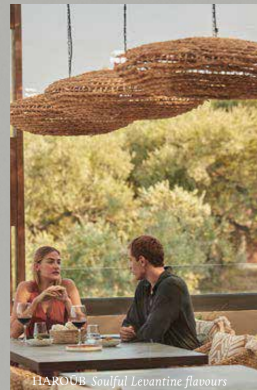
HAROUB Soulful Levantine flavours

Open kitchen with state-of-the art Jospes Robata-grill