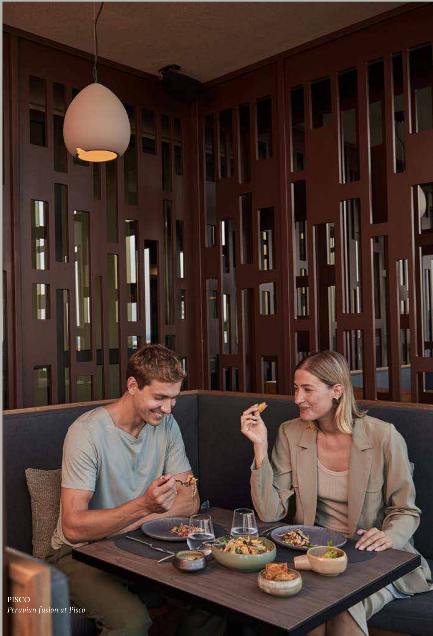
PISCO Peruvian fusion at Pisco