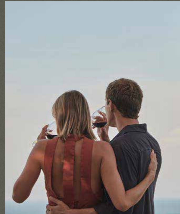
Wine and Tsipouro tasting