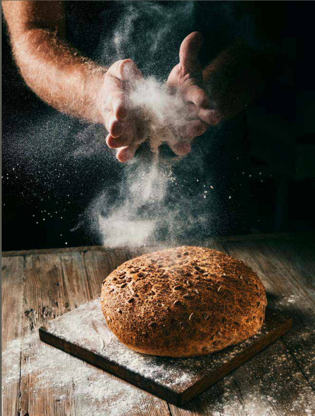
Pita and bread making