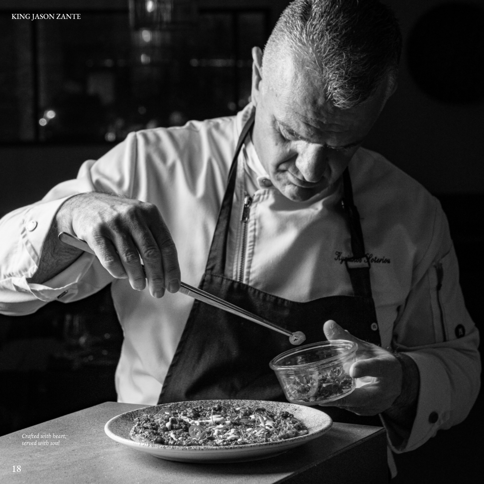
Crafted with heart, served with soul