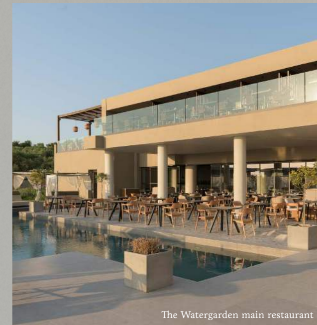
The Watergarden main restaurant

Meanwhile, at Pisco, our Peruvian fusion restaurant, bold and vibrant flavours combine in a joyous tribute to Peru's ancient culinary traditions, transporting you on an unforgettable taste adventure.