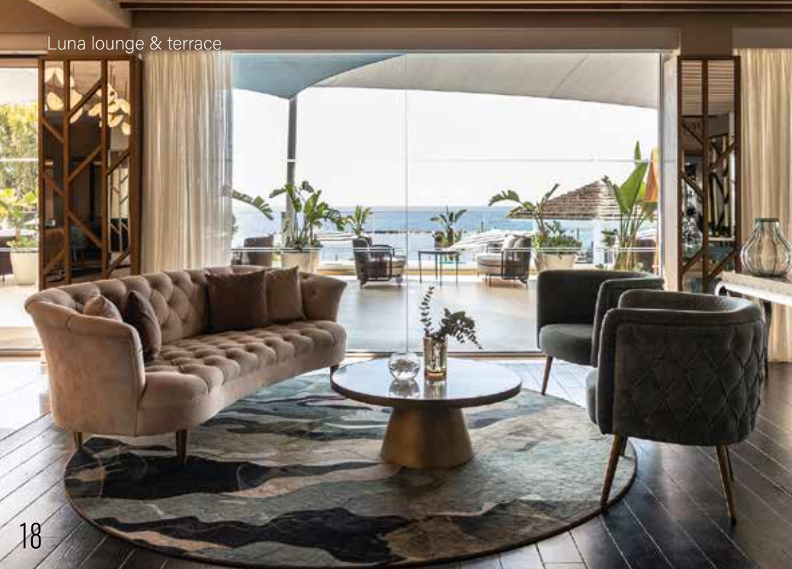
Luna lounge & terrace