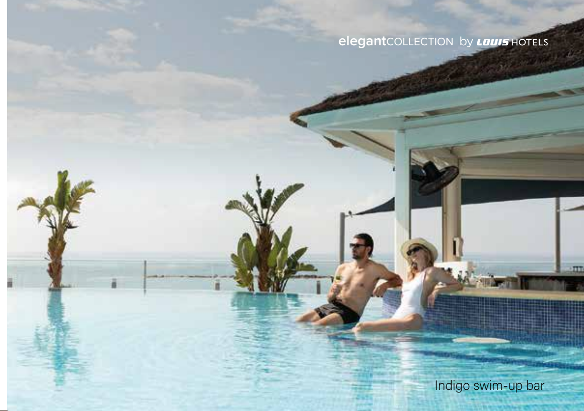
Indigo swim-up bar